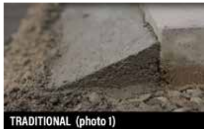
TRADITIONAL (photo 1)

Always refer to the latest GATOR XTREME EDGE Technical Data Sheet (TDS) at AllianceGator.com before installing GATOR XTREME EDGE . Concrete pavers, slabs, Natural and Wet cast stones should be installed according to ICPI Tech Spec 2 and ICPI Tech Spec 10 , utilizing industry established best practices for the base, setting bed, and drainage of a hardscape project.