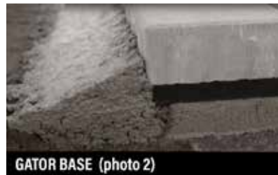
GATOR BASE (photo 2)