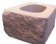
MEDIUM UNIT 6"H x 11"W x 12"D