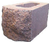
SMALL UNIT 6"H x 7"W x 12"D