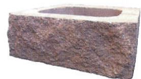
LARGE UNIT 6H x 18"W x 12"D

All 3 sizes sold on one pallet. One pallet = 22.5sqft.