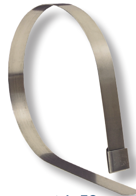
style FO (open end)

The FO clamp is open-ended and may be applied easily without sliding the clamp over the hose end.