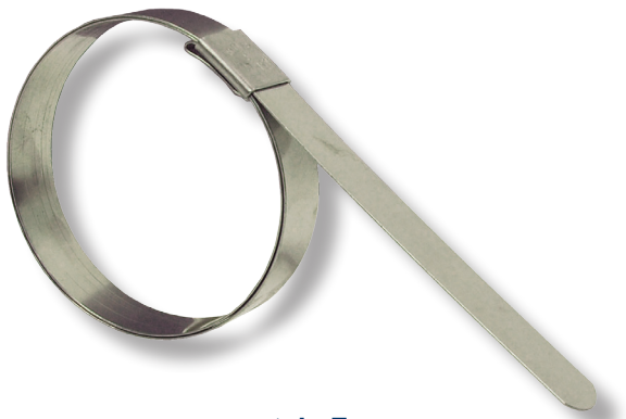
style F (pre-formed)

The F series double-wrapped metal band clamp is formed to a given diameter with a tailpiece through the buckle.