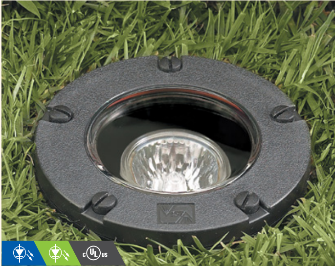
5272 Composite | 50 W max (hal.) | MR-16 Lamp or LED | LN-20 BAB/FG Std