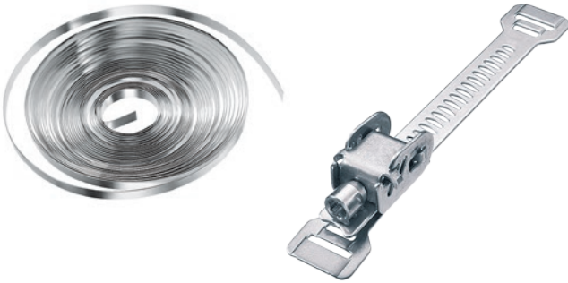
Stainless steel universal tension band and lock.

The universal tension band is available in 8 or 12 mm band width, each on rolls with lengths of 10, 20, or 30 m, with a suitable lock for band widths of 8 or 12 mm.