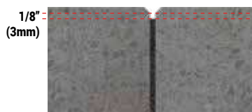
PAVERS OR NATURAL STONES WITH CHAMFER

POLYMERIC SAND REQUIREMENTS Minimum joint width: 1/8" (3 mm) Maximum joint width: 1" (2.5 cm) Minimum joint depth: 1 1/2" (38 mm)